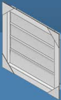
FS - 28