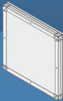
FC - 28