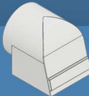
FH - 28